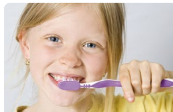
Enjoy fresh water for your body, free from impurities.