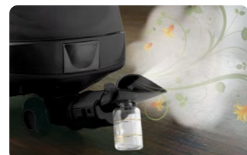
Breathe healthier with pure water in the humidifier.