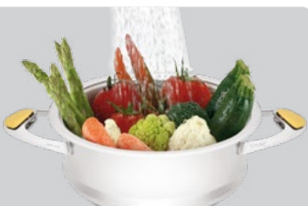
Ideal to wash vegetables and fruits free from water toxins.