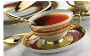
Tea and coffee will be a new superior taste experience.