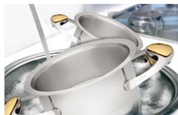
It provides limescale-free water to protect your cookware.